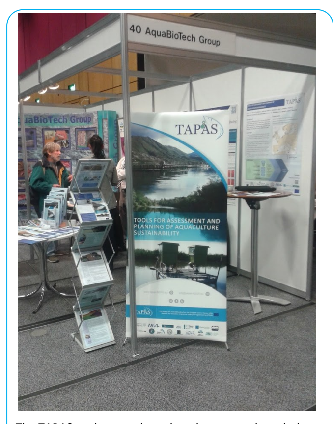
The TAPAS project was introduced to aquaculture industry representatives and scientists at the Aquaculture Europe 2016 conference in Edinburgh.

In another study a series of presently employed and adapted Ecological Models were compared to illustrate the most appropriate near field modelling procedures for marine and freshwater aquaculture sustainability throughout Europe, based on carrying capacity and site selection. This critical evaluation is the first stage of that process and provides the foundation for further work within the TAPAS project.